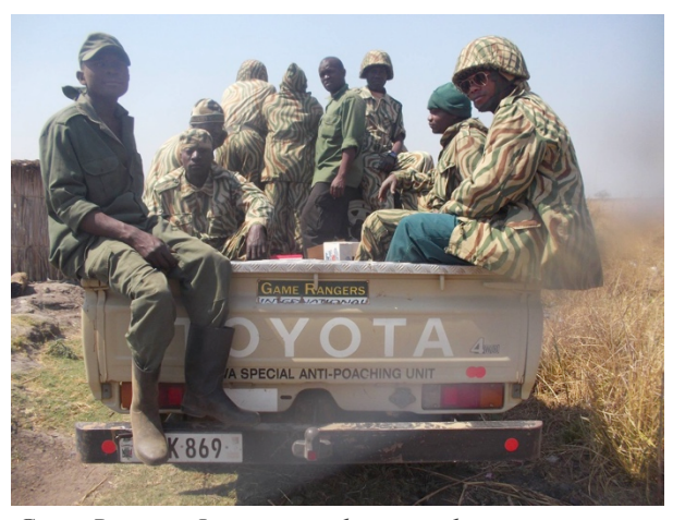
Game Rangers International scouts about to set out on patrol in Kafue, Zambia.

The elephants of the Kafue ecosystem in Zambia—one of the largest protected areas in the world—are under attack. As increasing numbers of people come across the border from the Democratic Republic of Congo, traffickers who want to exchange cheap Chinese goods for ivory enter Zambia. The threat has doubled since this time last year, with almost every patrol now intercepting armed poachers. Nowhere was worse affected than northern Zambia's Busanga Plains.