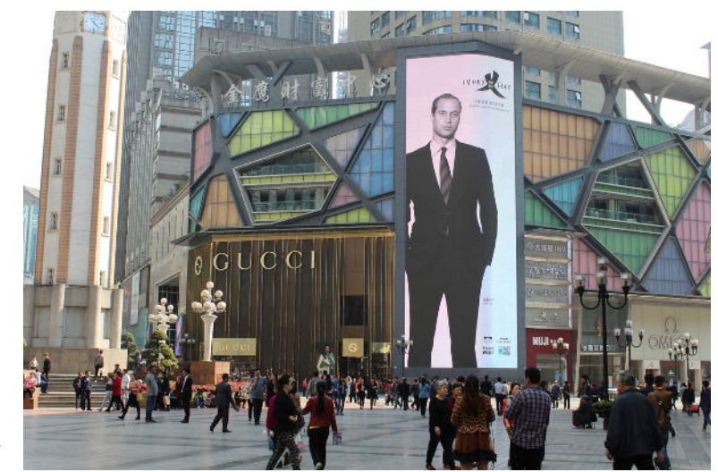
An Ivory Free ad—partially sponsored by the ECF—featuring Prince William in the central square of Chongqing (urban pop. 7.5 million).

to USD 2,100 a kilo but appeared to have leveled off by June