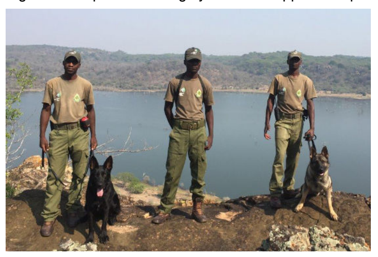
The Gonarezhou National Park Canine Unit with two German Shepherds trained in tracking and detection of firearms, ammunition and ivory.

In 2015, at least 102 new rangers were trained in anti-poaching work—some of these by US Marines and Special Forces—in Cameroon, Gabon, Nigeria, Mali, and Kenya. Collaborations between park rangers and government troops were fostered, bringing national defense forces into play in the Democratic Republic of Congo (DRC) and Mali. Informer networks were developed in many areas to guide operations. Collectively, the projects have made 572 arrests and recovered at least 91 firearms. High-tech elephant tracking systems to support anti-poaching efforts were installed in